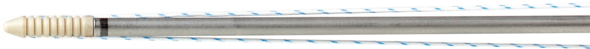
Anchor with One #2 Suture