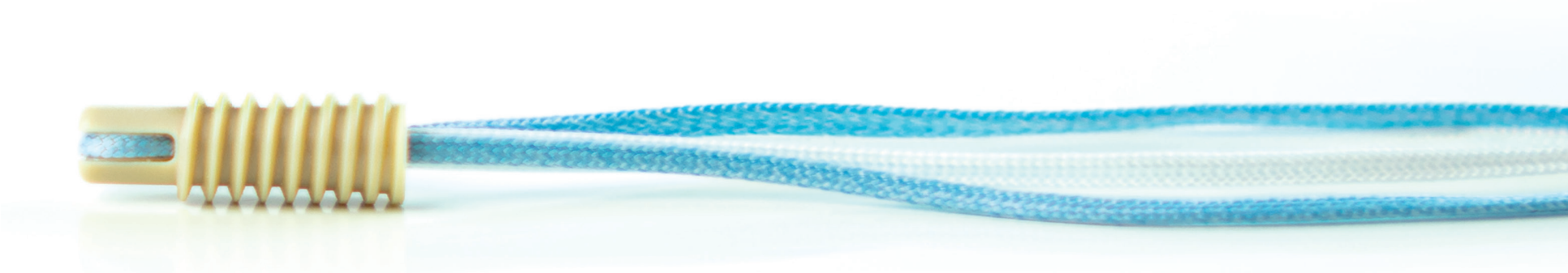
Anchor with Two Fiber-Connect Tapes