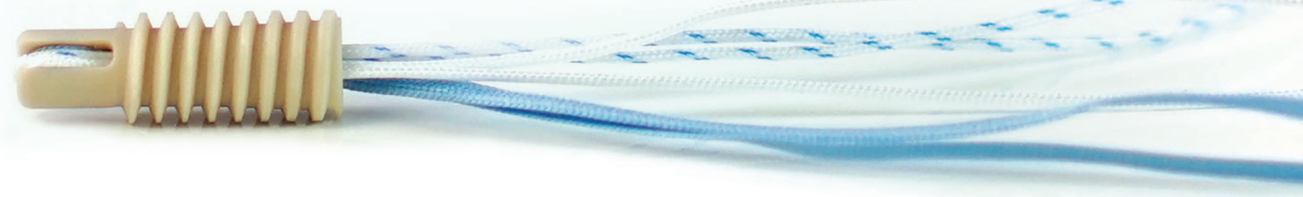
Anchor with Two Sutures & One Tape